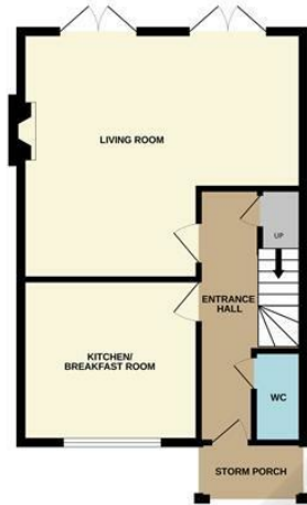
GROUND FLOOR 504 sq.ft. (46.8 sq.m.) approx.