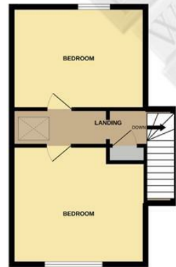
2ND FLOOR 393 sq.ft. (36.3 sq.m.) approx.